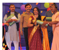
25th Silver Jubilee