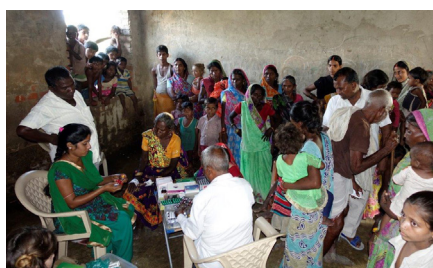
Jeevan Deep's Clinic regularly visits Bodhgaya's outlying villages.

BDA is in discussion with local providers to increase the quality of services available for villagers. It is our aim to ensure that professional skills and medicines are available to those in need.