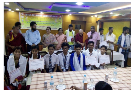
Some of the competition winners

The PV school plays a strong role in enriching the cultural fabric of the region through participating in and promoting key cultural events throughout the year. During 2016/17, these included celebrating the Buddha Jayant, the environment and tree-planting program, Teacher's Day, Children's Day and the 10th anniversary of Jeye Shri Mahabodhi Vihara.