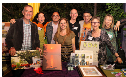
Successful fundraiser: Menopause the Musical.