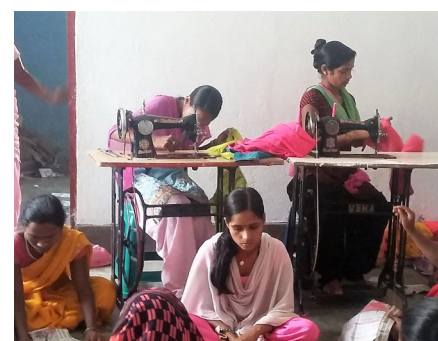
Village women learning dress-making.