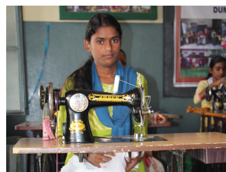
Sewing Classes for village women

the teachers to keep going even when they found it difficult. Participants' families say that their way of life has improved.