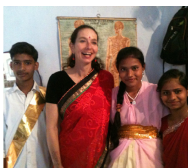
PVS Silver Jubilee 2015

You will read reports from our 'flagship' project, the inter-religious Prajna Vihar School—now in its 27th year—and from past-students who are making an impact on society in their own right. A timeline visually supports the impressive history of the school's existence (see pg.3).