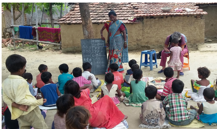
An outdoor informal classroom in one of the villages allows these children to receive education.

The new wells are significantly deeper, helping to drought-proof some of the villages in coming years.