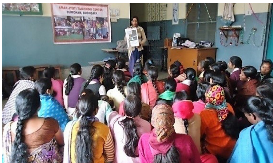
Sewing Classes for village women