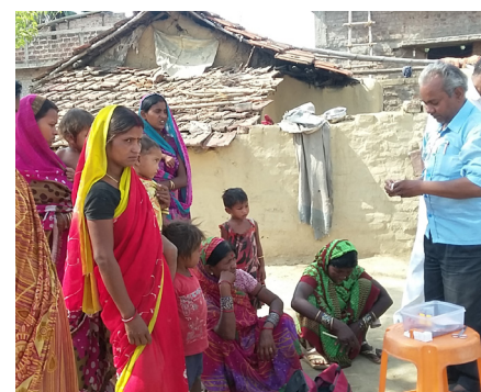
Jeevan Deep's Clinic staff provide basic medical care to people who would otherwise have no access to medical services.

As transport options are few, many villagers would have no access to health care without Jeevan Deep's Clinic staff.