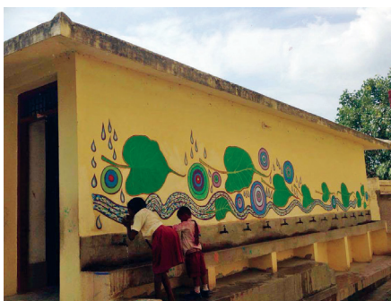
New water taps and toilet block

A long-awaited new toilet block for our 550 children was finally completed in October 2015. The new block has eight male and eight female toilets, which is a vast improvement on the old toilet block which housed just four toilets. We are very happy, proud and grateful for our beautiful new building. We express our heartfelt gratitude to all those who made it possible. In February of 2015 two guests filmed a tour of the new building as work was nearing completion. You can see their Youtube movie at https://youtu.be/d4a4x2j4L8c