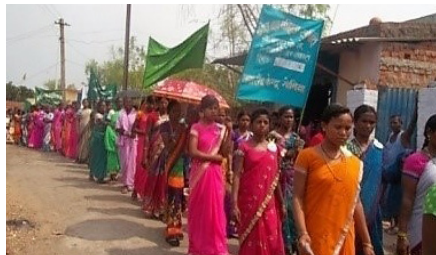
International Women's Day march, 2016

prioritises three clusters of work delivered through a Community Health project, a Residential TB Centre and an ongoing program of Non-Formal Education.