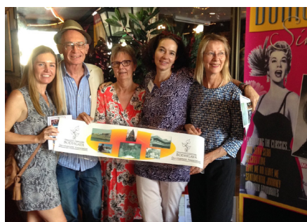
BDA Committee members at Doris Day fundraiser.